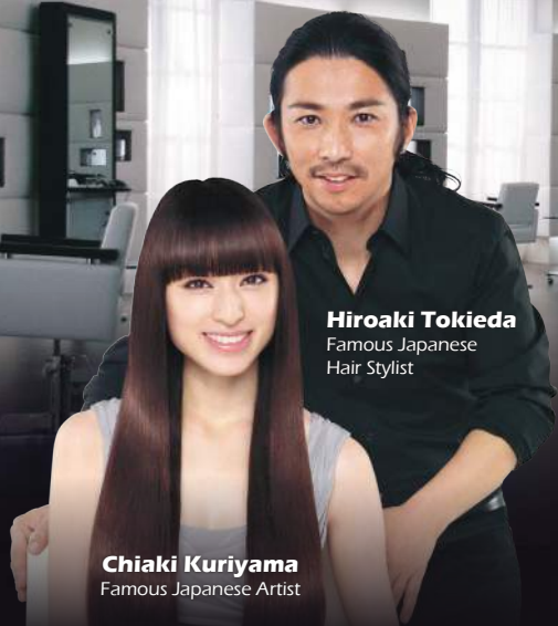
Hiroaki Tokieda Famous Japanese Hair Stylist